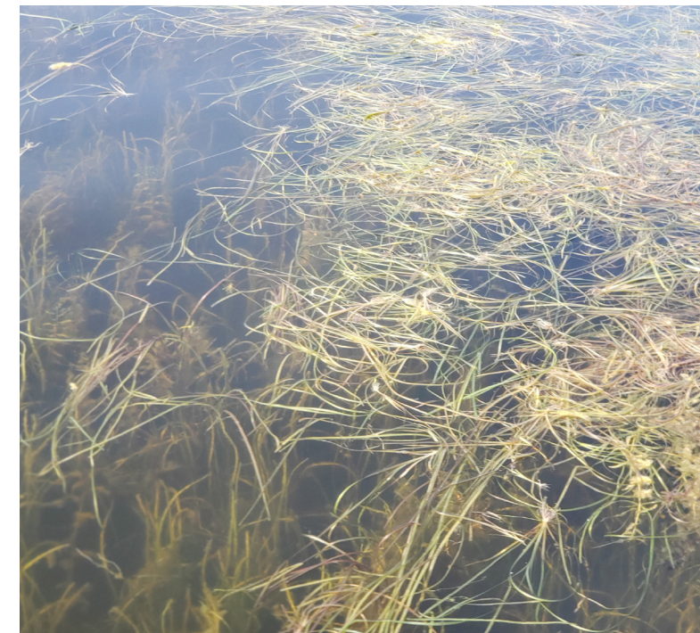
Wild Celery is one of the most dominant plant in Wind Lake. This plant has flat blades that look like grass. The leaves are growing as tall as 6 feet this year. The roots look like white tubers and often, multiple plants are connected by the tubers. It can become a nuisance when the plant becomes bouyant and releases from the sediments, floating around in large mats.

It's thick coverage of the lake bottom is however, very important in preventing the spread of SSW.